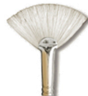
bristle fan Blend colors, create texture, grass, fur, and foliage