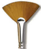
taklon fan Blend colors, create texture, grass, fur, foliage